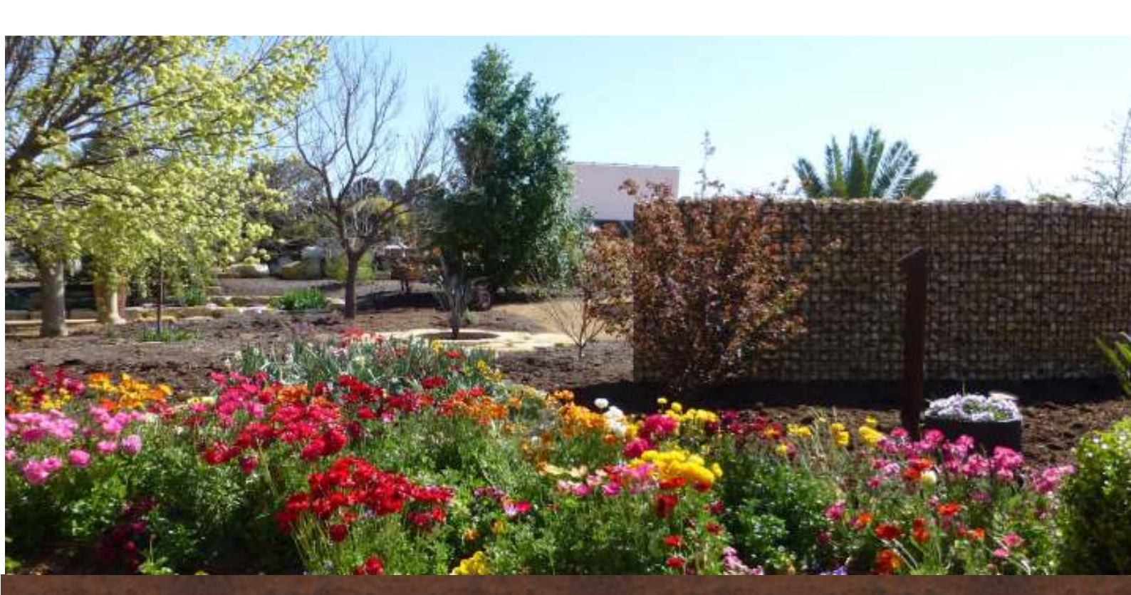
Garden Hire at Riverline Cottage & Gardens

A reproduction stone cottage was completed in 2015 which is available to hire for accommodation or to utilise when the garden is booked for a function.